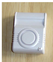
Example of trembler alarm distributed to residents

by local residents. The majority of the burglaries had a similar M.O, mostly forced rear doors or forced open windows. This meant that a lot could be done to help the residents make their properties a harder target for this type of crime. With this in mind the Neighbourhood Police Team deployed in the area in a one day programme to visit as many properties as possible to provide burglary and home security advice and where appropriate fit free trembler alarms to the possible points of access.